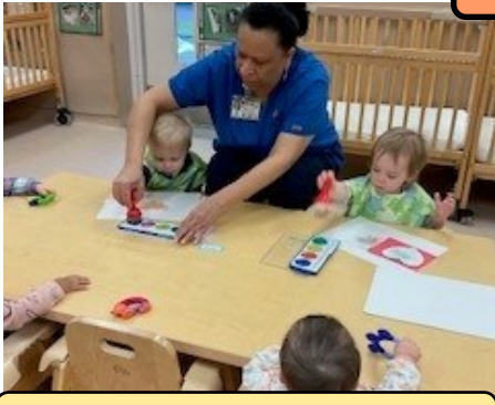
7. Demonstrates fine-motor strength and coordination. 7a. Uses fingers and hands.