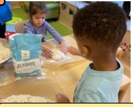
25. Demonstrates knowledge of physical properties of objects and materials.