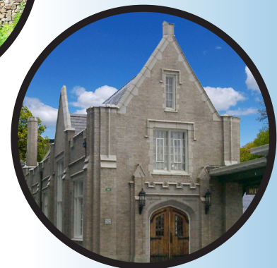
Class of '47 Train Station