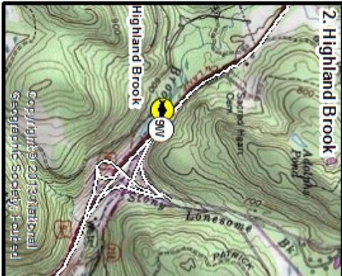
2. Highland Brook