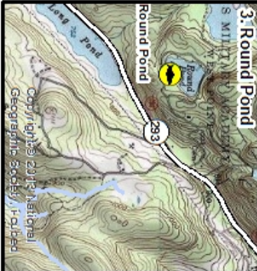
3. Round Pond