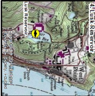
4. Lusk Reservoir