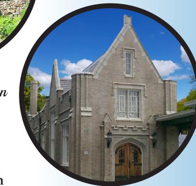
Class of '47 Train Station