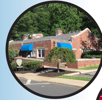
Buffalo Soldier Pavilion

All rental prices will vary during home football games, holidays and graduation.