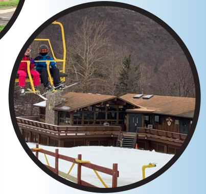
Class of '48 Ski Lodge

West Point Family and MWR Indoor & Outdoor