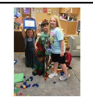
Future Architectures of America