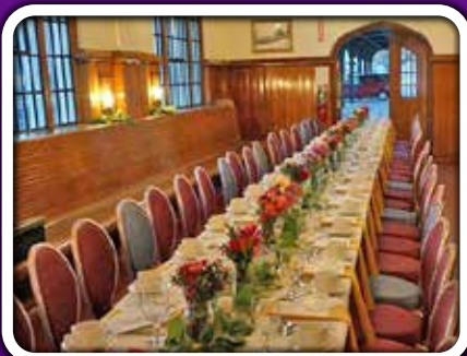
CLASS OF '47 TRAIN STATION

VISIT THE WEST POINT FAMILY & MWR ONLINE AT WESTPOINT.ARMYMWR.COM