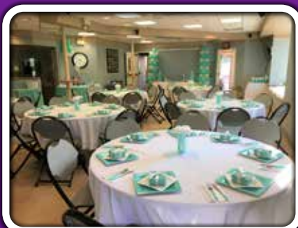
BUFFALO SOLDIER PAVILION