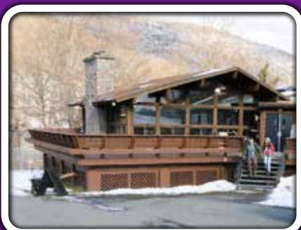
VICTOR CONSTANT SKI LODGE