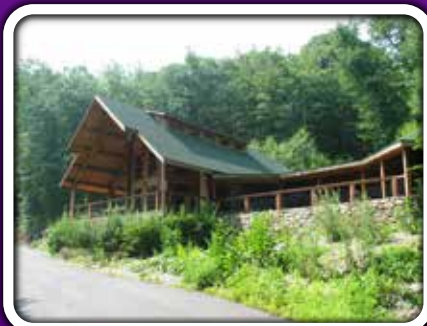
CLASS OF '49 LODGE