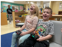
Having a Blast playing Video Games!