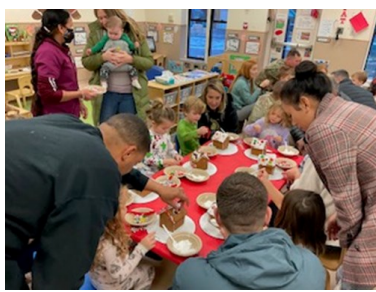
December Gingerbread House Parent Participation