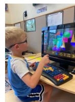
Blocks on the computer!