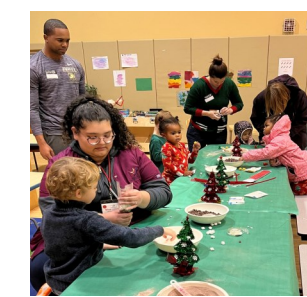
Hot Cocoa Pouch Creations