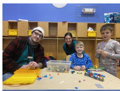
STEAM with Legos!