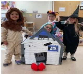
Costume Day/ Parade