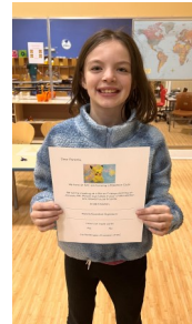
Introducing: Pokémon Club