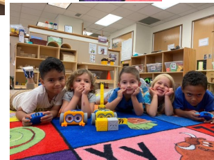
Robot Races with Friends!