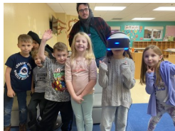
Gaming with VR Headsets!