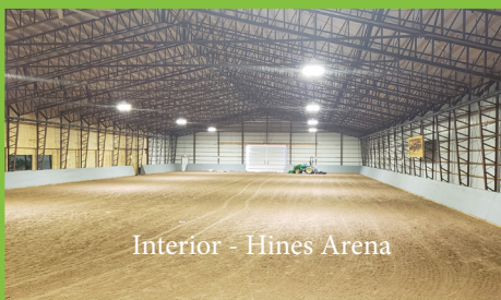
Interior - Hines Arena