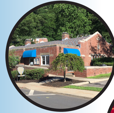
Buffalo Soldier Pavilion

All rental prices will vary during home football games, holidays and graduation.