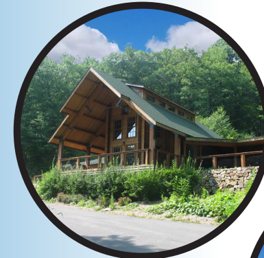
Class of '49er Lodge