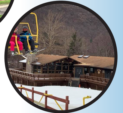
Class of '48 Ski Lodge

West Point Family and MWR Indoor & Outdoor