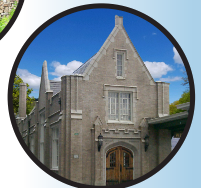
Class of '47 Train Station